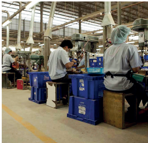
Figure 5: Plan Toys manual production of the dollhouse

Figure 6 shows a finished green dollhouse with furniture. The company has worldwide recognition for its sustainable manufacturing good practice.