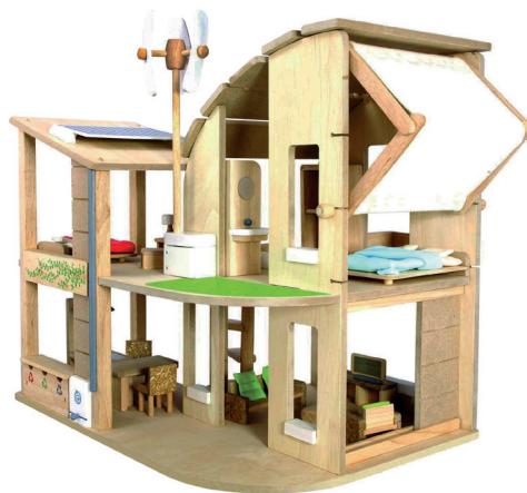
Figure 6: Green dollhouse with furniture